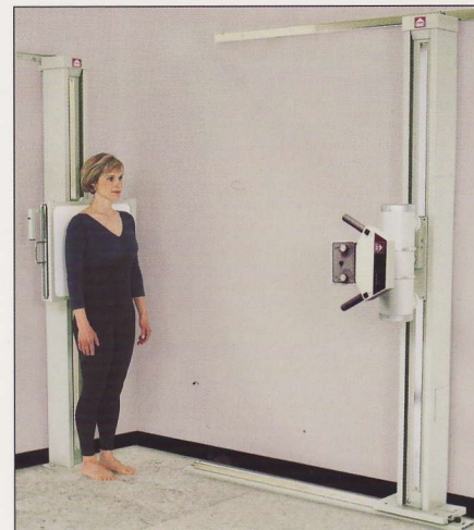
Platinum System with traditional wallstand option.

A traditional floor-wall or floor-ceiling tubestand provides film focal distances of 40" to 72". The tubestand is constructed of heavy-duty steel, insuring many years of reliable service. Stainless steel ball bearings allow effortless positioning of the x-ray tube and precise alignment to the wallstand over the entire range of travel. The tubestand angulation dial is an easy-to-read, accurate indicator of tube angle. Sturdy electric locks provide secure placement of the x-ray tube. Add Summit's mobile table for supine radiographs and routine examinations.