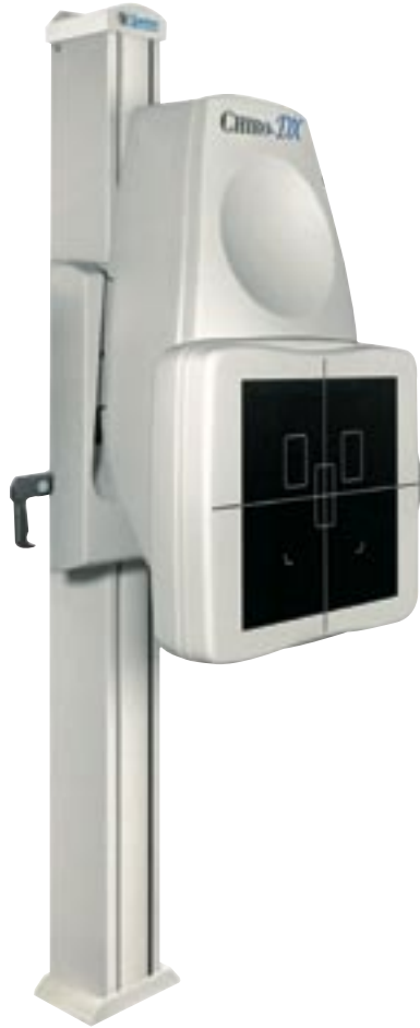
Chiro-DX Wall Stand

DR (Direct Radiography) is now available and affordable to the chiropractic professional. Quantum's advanced technology incorporates CCD Technology (Charged Couple Device) on the wall stand for efficient and cost effective solution. The Chiro-Dx system produces images in less than six seconds without the need for cassettes.