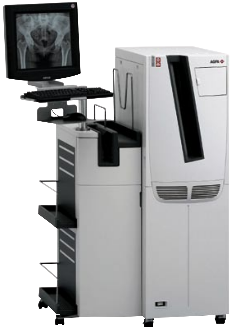
Quantum/Agfa CR25.0L, shown with optional CR User Station, which provides space for workstation, Cassette ID functionality and cassette storage.